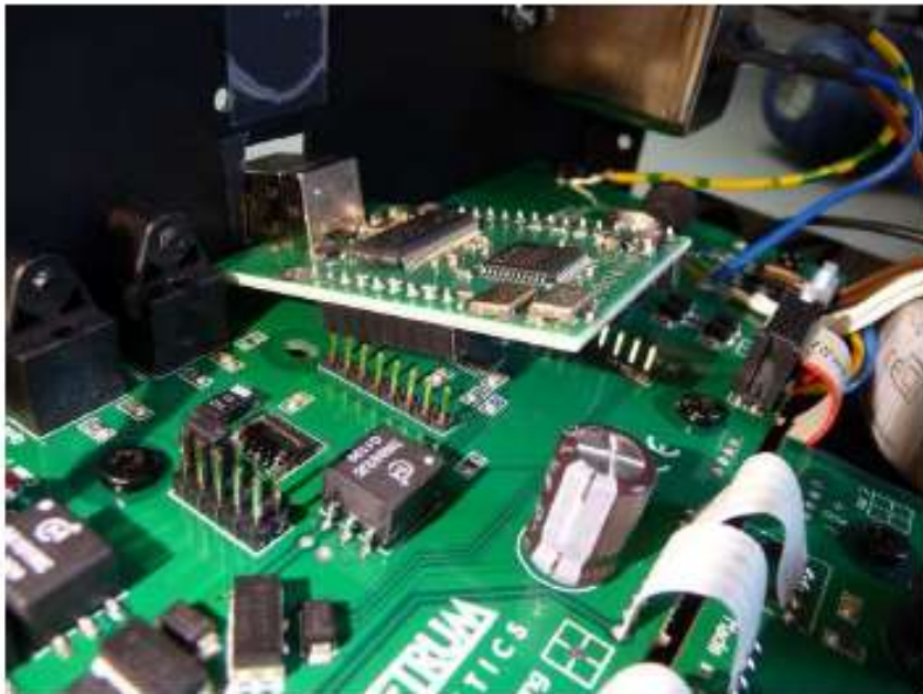
Installing the USB Board.