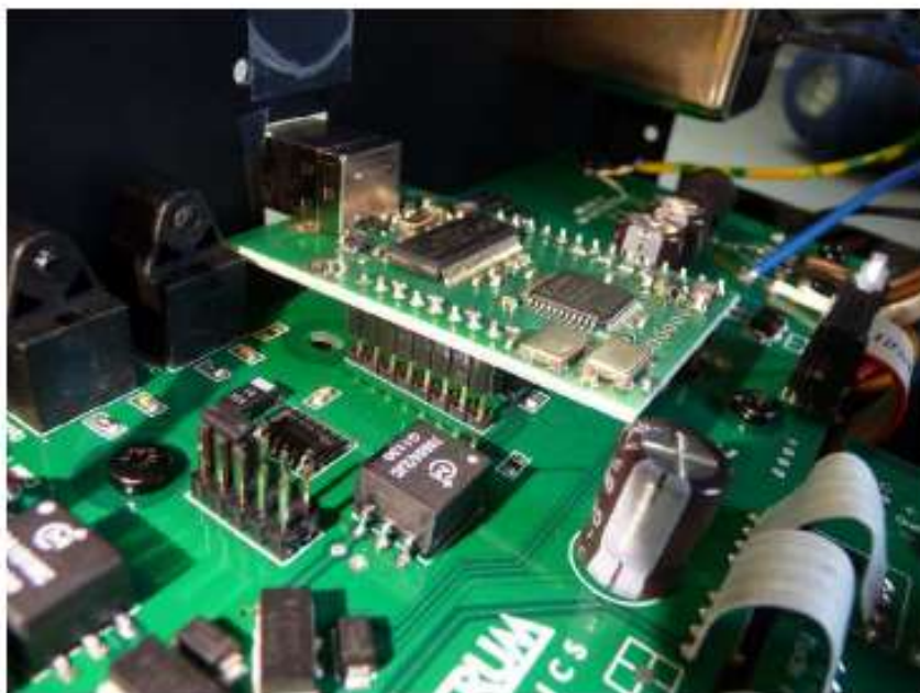
When the board is in place and properly aligned, push on both sides until firmly in place.