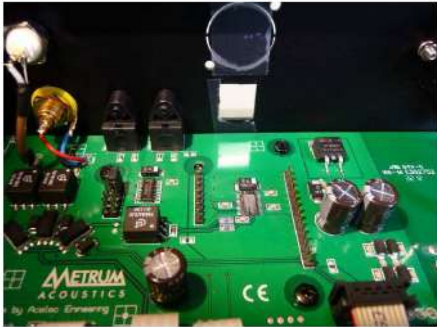
USB cover removed.