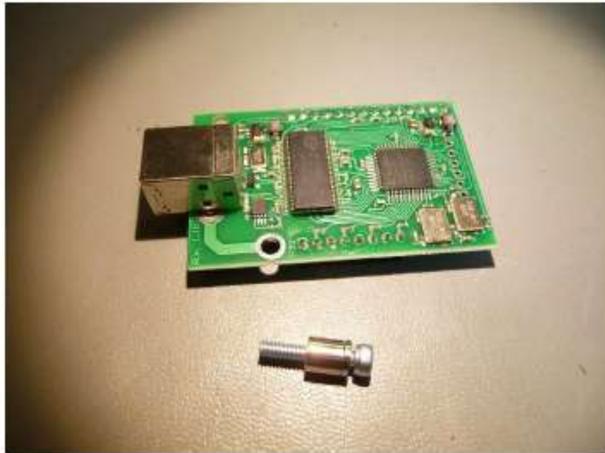
Length of spacer 7mm – M3 Hex screw.